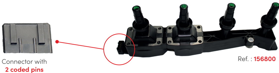
Connector with 2 coded pins

The 156800 coil matches with the OEM 597012 and 597056 . It is fitted to PSA vehicles with a model year between May 1996 and December 2000 (older vehicles type 106 II S16 TU5J4). This coil has a connector with 2 grooves .